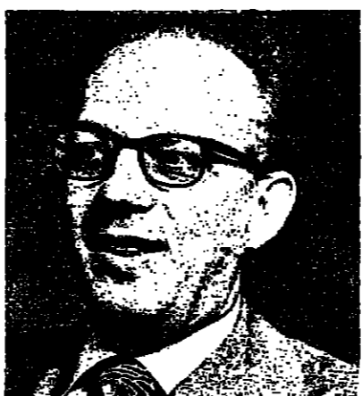
Dr. Raymond Sackler

Dr. Raymond Sackler, who together with his two brothers has donated $3m. to the Tel Aviv University Medical School, is a man who does not seek the limelight. He was reluctant to speak himself in an interview here this week.